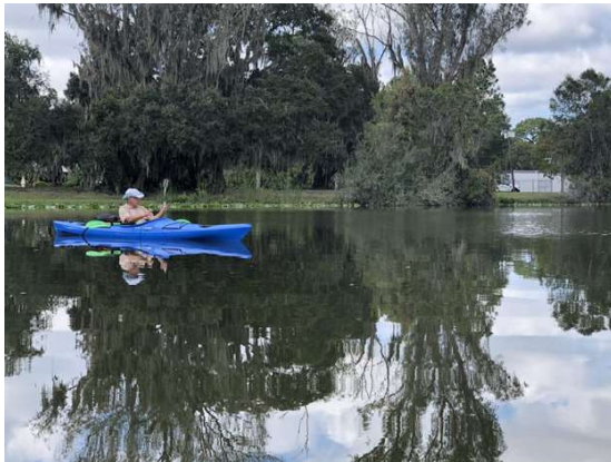
Healthy Pond Field Day participant is trying out different water chemistry probes and putting the results within the context of local pond water chemistry.