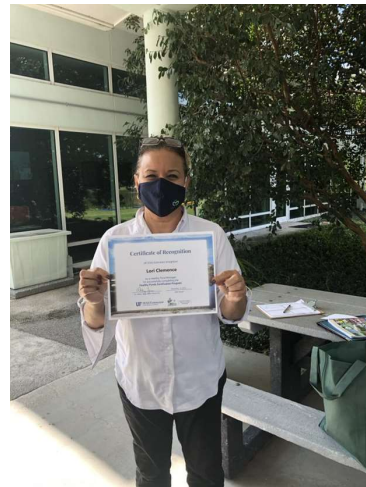
Stormwater pond managers show off their Certificate of Recognition at the end of the field day.

Stormwater is the biggest contributor to water pollution in Florida despite the over 75,000 stormwater ponds that have been created to deal with this issue. The need for education about these systems was apparent. Extension agents often receive calls from homeowner associations or stormwater pond professionals dealing with pond problems and looking for solutions.